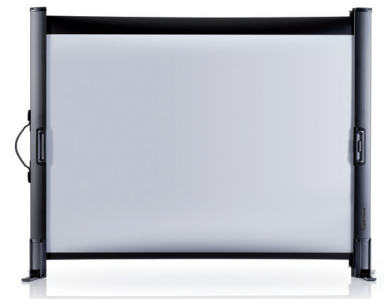
40" Supernova Mobile